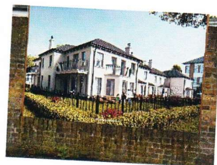
The Old Historian

The house was sold by the family to Middlesex County Council in 1943 who converted it into a Care Home. The building has been empty for a number of years, but due to its local historical interest it is to be 'sensitively' modernised to bring it back into use for residential use: